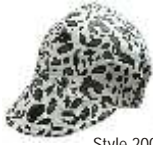
Style 2000 E

Reversible Cap Print/Solid Sizes: 6 1/2" - 8"