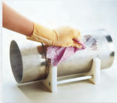
While wearing gloves, use the abrasive side of the wipe to remove contaminants from the pipe or other surface to be cleaned