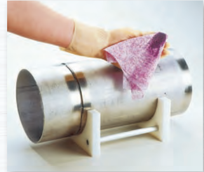
Use the smooth side to re-wipe the surface, ensuring all impurities are removed